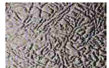
Rimex's Leathergrain Pattern

Additionally, Rimex has now added 60" wide materials in the Leathergrain pattern, as well as the 5-SM and Tread-Tex materials. These patterns, made of anti-graffiti steel, hide scratches, dents, and wear and tear far more effectively than a # 4 polished stainless steel.